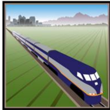
San Joaquin Joint Powers Authority